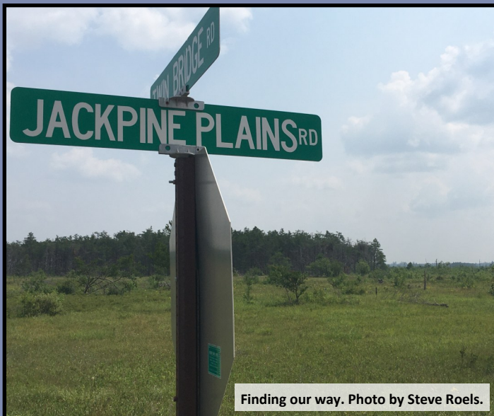
Finding our way.