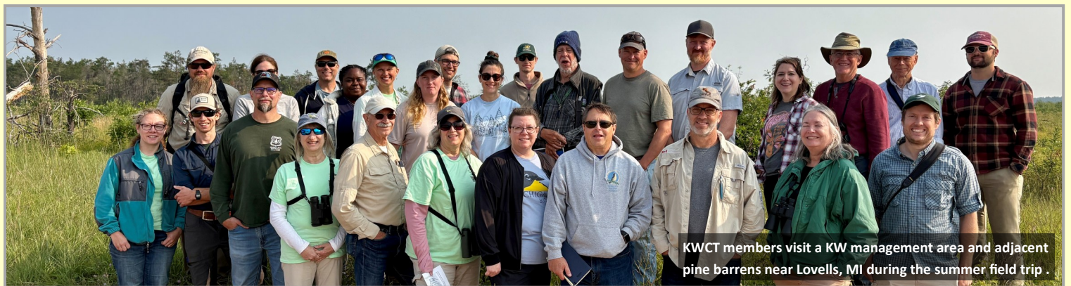
KWCT members visit a KW management area and adjacent pine barrens near Lovells, MI during the summer field trip.