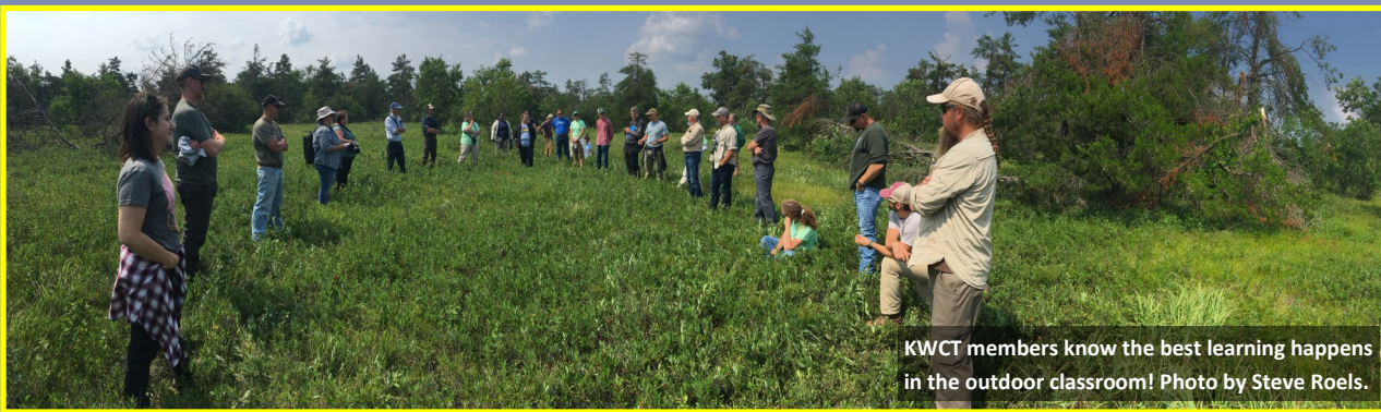
KWCT members know the best learning happens in the outdoor classroom!